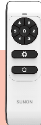
RF Remote Controller