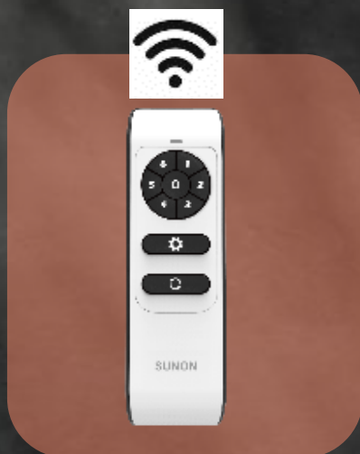
RF Remote Controller

SUNON provides 5 types of operations based on various industry applications and users' requirements.