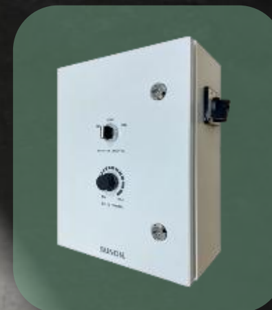
J BOX_Knob Knob Controller