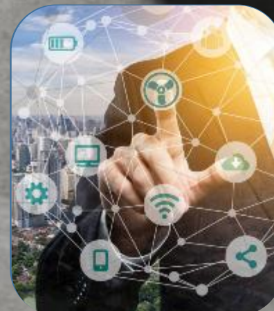
J BOX_BMS (Modbus) Building Management System