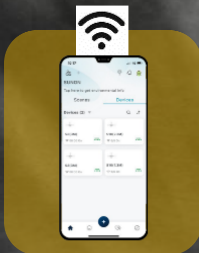
S TOUCH_AIoT Smart Phone as the Remote