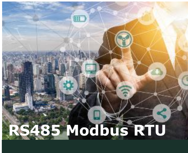
RS485 Modbus RTU