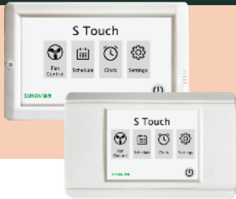
S TOUCH_N5 /N30 Touch HMI Panel