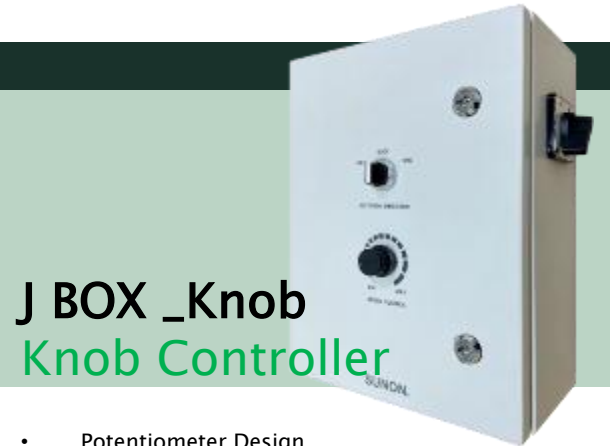
J BOX_Knob Knob Controller