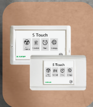
S TOUCH_N5 /N30 Touch HMI Panel