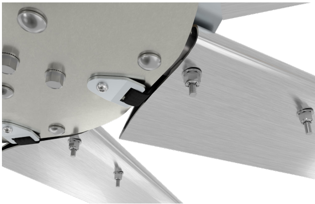
Hub Attachment Point